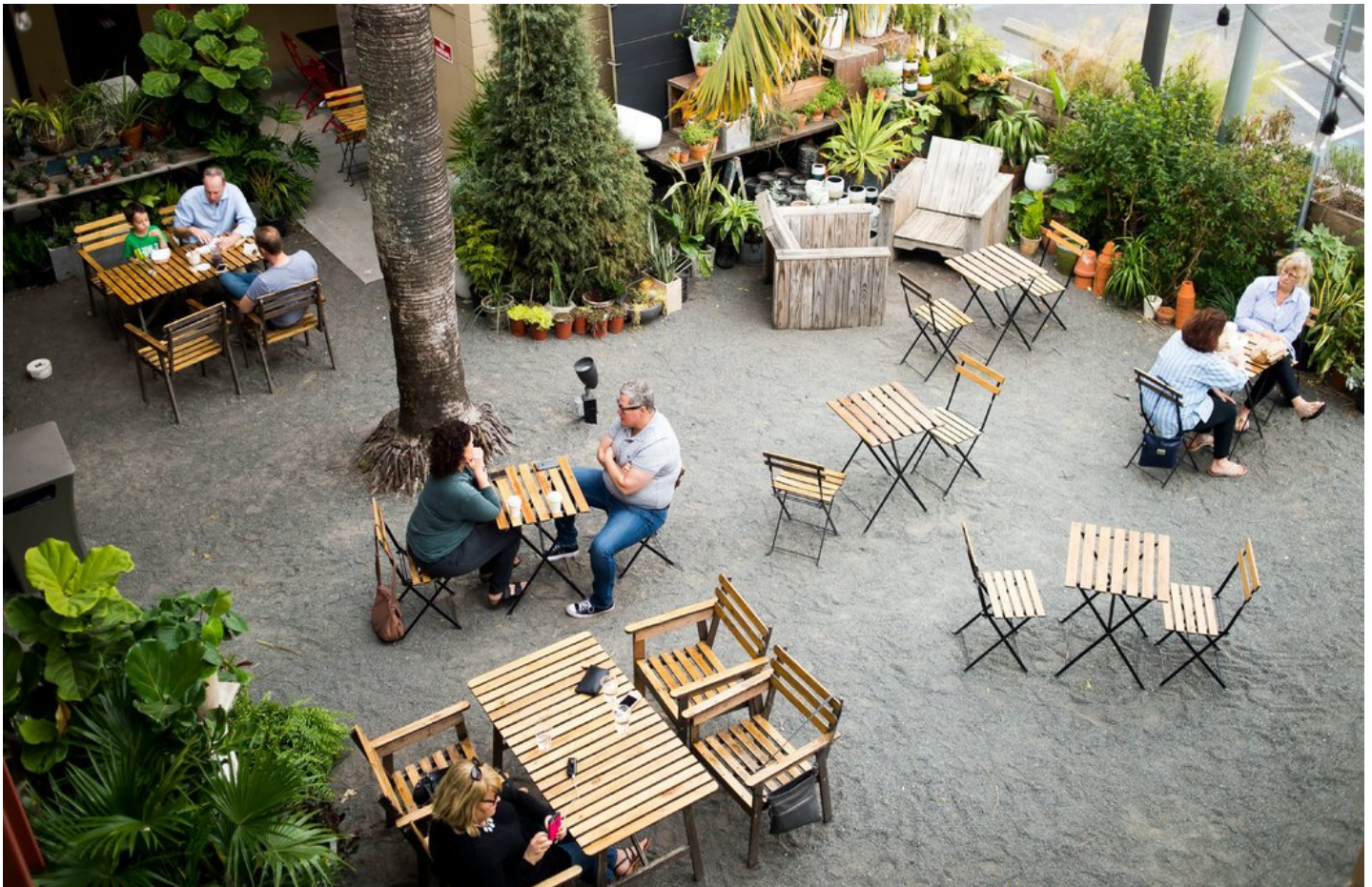
Patrons enjoy the creative energy of the East End Market.

The culinary arts and the fine arts meet at the Alford Inn at Rollins , a few blocks from Park Avenue. Established by Rollins College, the nonprofit inn funnels all proceeds to its scholarship programs. Contemporary art fills the ground floor of the 112-room hotel in a rotating arrangement overseen by the curators of the Cornell Fine Arts Museum. Join the locals for post-dinner drinks in admiring the art or sitting around the courtyard fires beside the bougainvillea hedges.