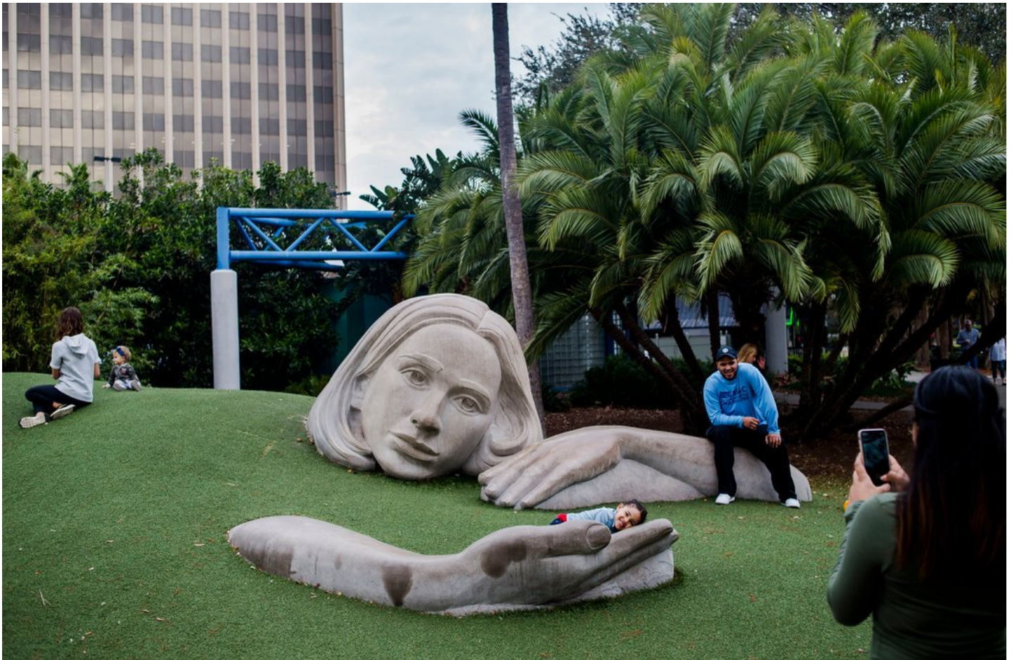
Meg White's "Muse of Discovery" statue is a public art installation near Lake Eola.