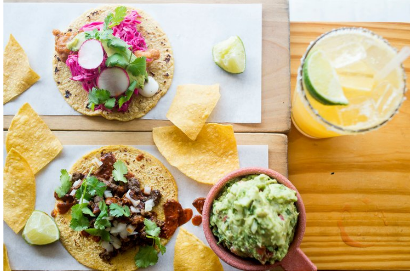
Tacos are a big part of the Orlando culinary scene.

over a gin-and-cucumber Mathers Fizz ($15) and a bowl of roast fava beans ($8) served on silver platters.