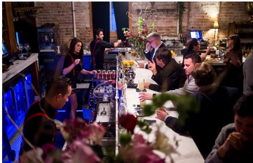
Mathers Social Gathering is a downtown speakeasy-style bar on the third floor of a 19th-century furniture store.

One of Winter Park's affluent part-timers was Charles Hosmer Morse, whose heirs eventually amassed the largest collection of glass works by Louis Comfort Tiffany in the world and made it the anchor of the Charles Hosmer Morse Museum of American Art . In addition to wall-size, garden-themed panels, the museum's Tiffany collection includes the kaleidoscopic chapel he created for the 1893 World's Columbian Exposition in Chicago and several rooms from Laurelton Hall, his Long Island estate. For contemporary ballast, cross the leafy Rollins College campus to the Cornell Fine Arts Museum , which mounts shows with pieces that range from old master paintings to modern-day neon.